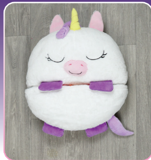
6. Happy Nappers® Sleepy Sack is ready to be used as a pillow or store away!

Happy Nappers is a registered trademark of Jay at Play. Product Color and Appearance May Vary. Patent No. US 11,129,486 B2. EP 3 829 401 B1