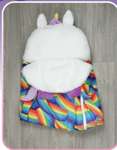
2. Fold the unit upward to allow the base portion of the character to meet the upper. Secure the two button snaps on the lower/upper portion of the character.