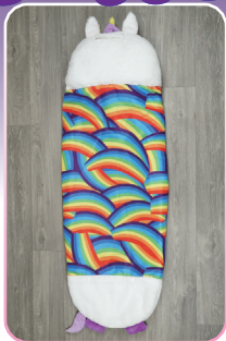
1. Lay the Happy Nappers® Sleepy Sack face down on a flat surface.