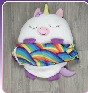
4. Stuff the body into the base of the character.