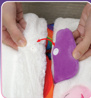
5. Secure snaps under the front paws to the lower base of character.