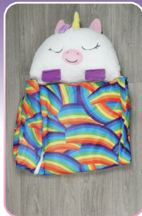
3. Flip unit over.